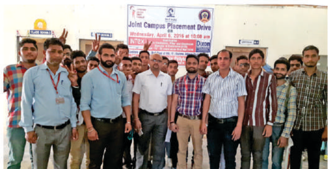
86 Students selected in Intex & Dixon