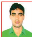
RAM RATAN PSPCL APPRENTICESHIP