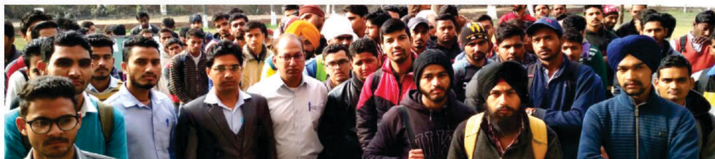
More then 100 students selected in ITC