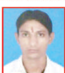
VIJAYPAL ELEC. HERO APPRENTICESHIP