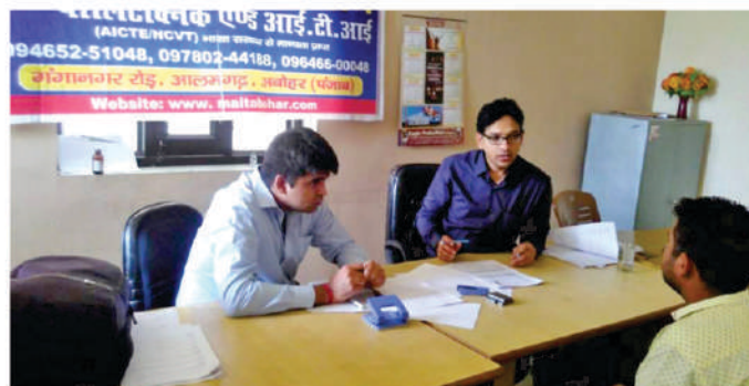
Campus Drive Daikin AC India Ltd.