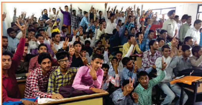
176 Students selected in Maruti Suzuki