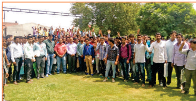
188 Students selected in Honda Car